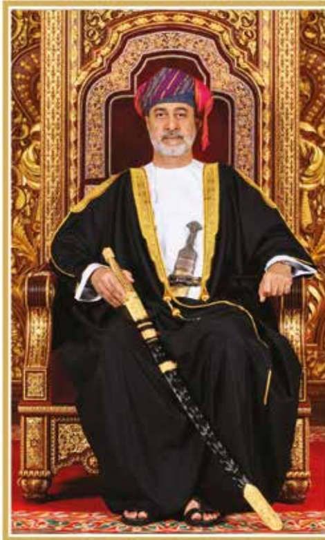
حضرة صاحب الجلالة السلطان هيثم بن طارق المعظم